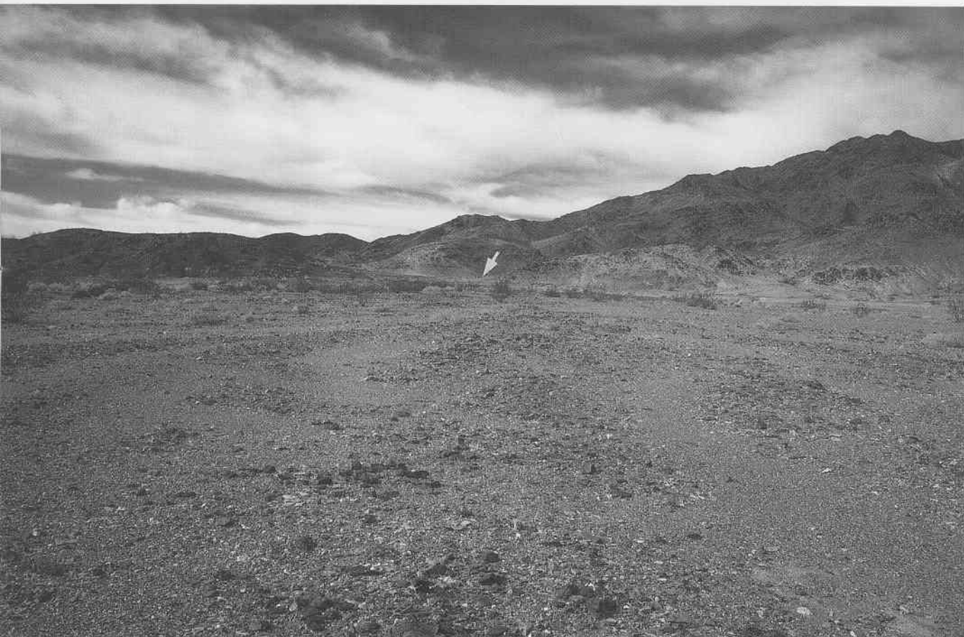
▲Distant View of the Contact Spot. The arrow indicates the place where George Adamski made the first contact with a visitor from the planet Venus, on Nov. 20, 1952.