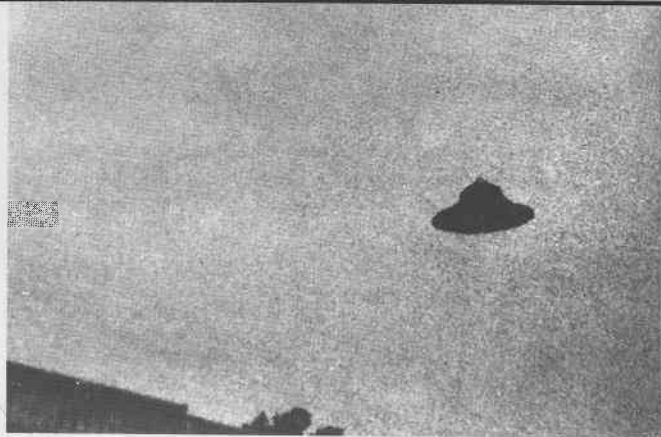
▲ Adamski-type UFO over Onomichi.

Immediately upon publishing his first book, George Adamski became a target of criticism, blame, and reproach by a great number of people. Many of them would claim