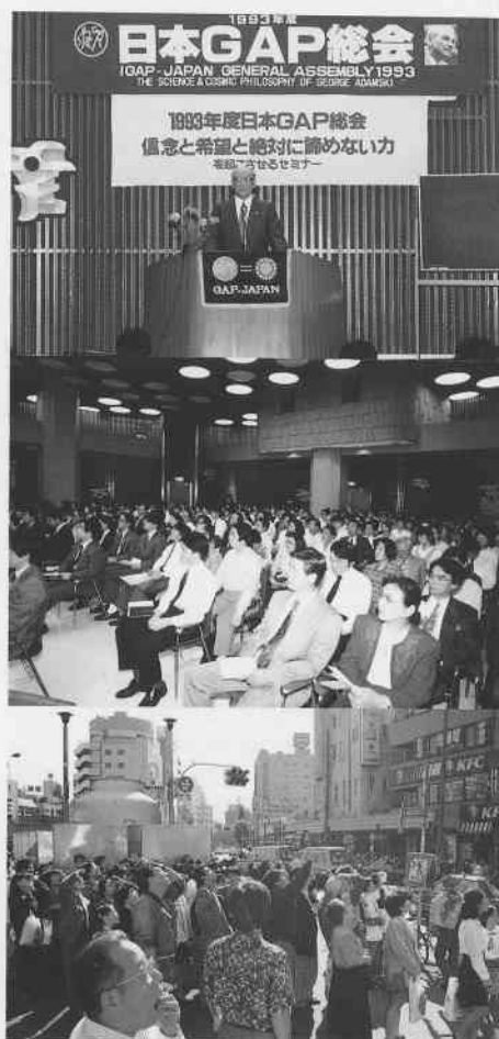
▲ Top: 1993 GAP-Japan General Assembly held in Tokyo on October 10, 1993.